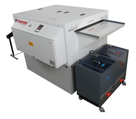
A Colenta MC2x40 supporting a 66 PCB Filmprocessor

A Colenta MC2x40 supporting a StudioLine Paperprocessor